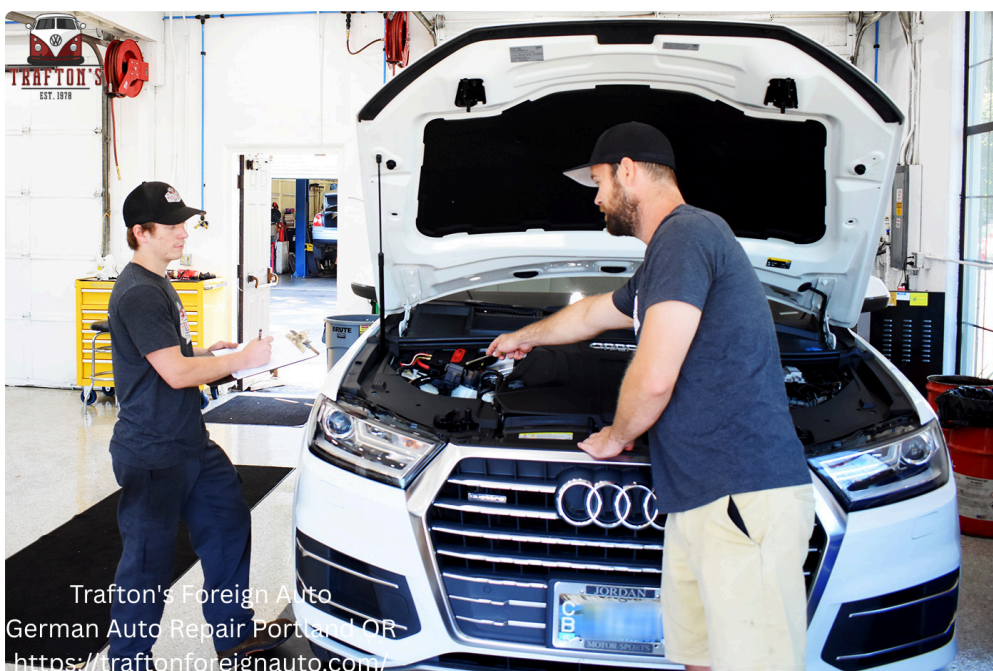
Trafton's Foreign Auto German Auto Repair Portland OR https://traftonforeignauto.com/

The established Portland marketplace consists of retailers that explicitly mention this level of labor. German Formula Auto Repair notes engine and transmission restoration and rebuilding. Heckmann & Thiemann Motors says it handles accomplished engine rebuilds. Trafton's Foreign Auto explicitly lists German Engine Rebuild. Those are meaningful differences given that not every store that will service brakes and fluids is install for important inner mechanical work.